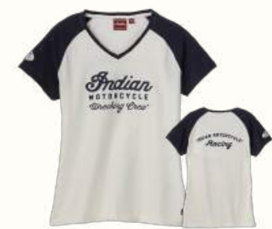
NEW WRECKING CREW TEE, WHITE Fabric: 100% cotton Graphics: Embroidery on front and back, patch on sleeve Fit: Classic XS-3XL 2861917