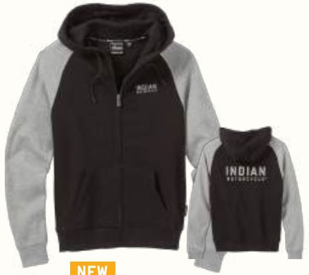
NEW ROGUE CONTRAST SLEEVE HOODIE, BLACK Fabric: 70% Cotton 30% Polyester loopback Graphics: Embroidery on front and back XS-3XL 2861925