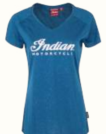
HERITAGE SPARKLE TEE, TEAL AVAILABLE FOR DELIVERY NOW Fabric: 65% polyester, 35% rayon Graphics: All over sparkle print, glitter print on front Fit: Relaxed XS-3XL 2860943