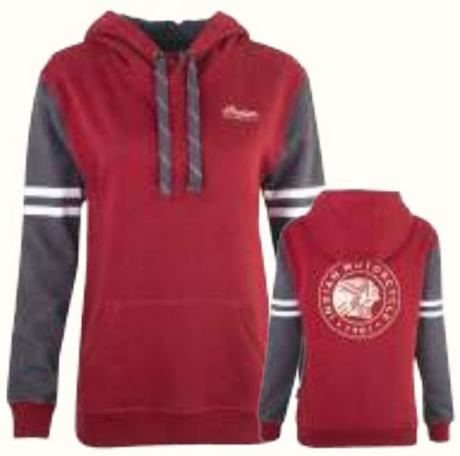
HERITAGE QUILT STITCH HOODIE, RED AVAILABLE FOR DELIVERY NOW Fabric: 70% cotton, 30% polyester marl brushback Graphics: Embroidery on front and back XS-3XL 2868942