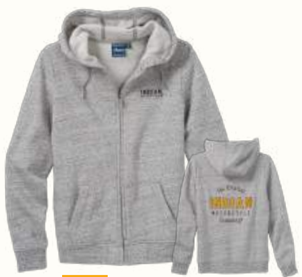
NEW MOTO TEXTURED LOGO HOODIE, GRAY 70% Cotton 30% Polyester nep brushback Graphics: Embroidery on front and back, towelling embroidery on back XS-3XL 2861931