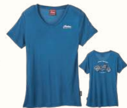
NEW DIAMANTE BIKE TEE, TEAL Fabric: 50% Cotton 50% Modal Graphics: Glitter print on front and back, diamante studs on back Fit: Relaxed XS-3XL 2861912