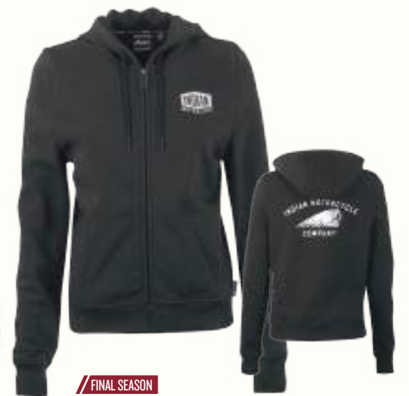
FINAL SEASON ROGUE HEADRESS HOODIE, BLACK AVAILABLE FOR DELIVERY NOW Fabric: 55% cotton, 45% polyester brushback Graphics: Print on front and back XS-3XL 2860800