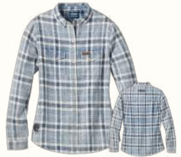
NEW MOTO INDIGO PLAID SHIRT, BLUE Fabric: 100% cotton denim Graphics: Embroidery on back, print on hem XS-3XL 2861929