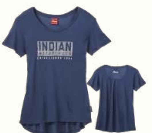
NEW LOGO STUD TEE, NAVY Fabric: 50% Modal 50% Cotton Graphics: Glitter print and diamante studs on front Fit: Relaxed XS-3XL 2861915