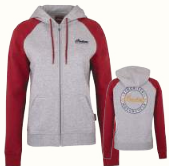
HERITAGE DIAMANTE ICON HOODIE, GRAY AVAILABLE FOR DELIVERY NOW Indian Motorcycle icon graphic made entirely of diamantes. Fabric: 70% cotton, 30% polyester marl brushback Graphics: Embroidered on front, diamante studs on back XS-3XL 2860949