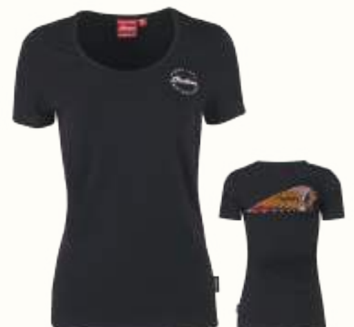
FINAL SEASON DIAMANTE TEE, BLACK AVAILABLE FOR DELIVERY NOW Indian Motorcycle headdress made entirely of diamantes. Fabric: 95% cotton, 5% elastane Graphics: Glitter print and diamante studs on front, diamante studs on back Fit: Close XS-3XL 2860946