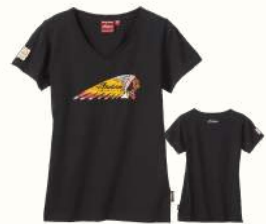
NEW COLOR HEADDRESS TEE, BLACK Fabric: 100% Cotton Graphics: Print on front Fit: Classic XS-3XL 2861910