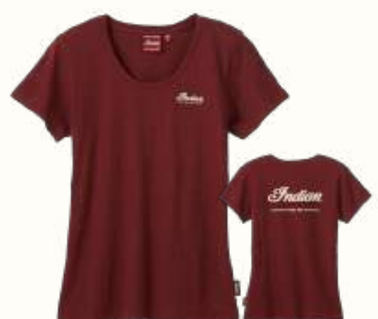
NEW MOTORCYCLE TEE, RED Fabric: 100% Cotton marl Graphics: Print on front and back Fit: Classic XS-3XL 2861913