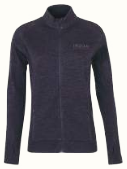
ROGUE MERINO ZIP THRU, GRAY AVAILABLE FOR DELIVERY NOW Keeps you warm in the cold and cool in the heat. Fit and features provide ultimate comfort. Breathes to prevent overheating. Non itchy and naturally odor resistant. Machine washable and dries fast. Fabric: 95% Merino wool, 5% nylon Graphics: Print on front XS-3XL 2860956