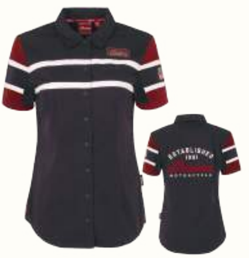
HERITAGE APPLIQUE SHOP SHIRT, BLACK AVAILABLE FOR DELIVERY NOW. FINAL SEASON Fabric: 65% polyester, 35% cotton Graphics: Patch on front, embroidery on back XS-3XL 2860948