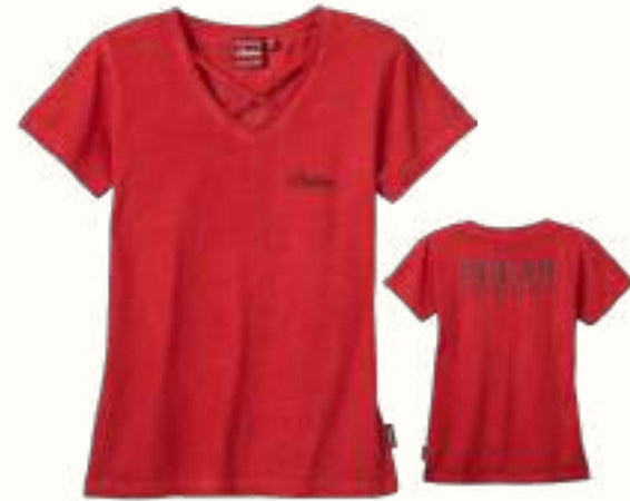
NEW STARLIGHT TEE, RED Fabric: 100% Cotton Graphics: Print on front and back, diamante studs on back Fit: Classic XS-3XL 2861914